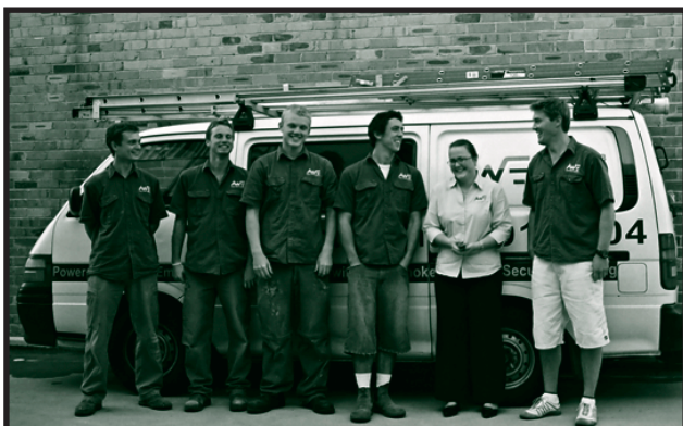
... and when the Boss makes a joke ... ALL must laugh!