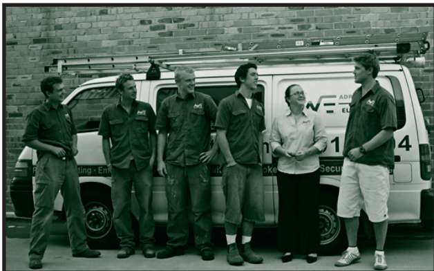
When the Boss talks - all must listen!

As the Christmas holidays are fast approaching, we wish to inform you that our office will be closed from 5:00pm Thursday 21st December 2006 through to 9:00am Monday 8th January 2007. If you have an emergency during this time you can contact Energy Australia on 131 388.